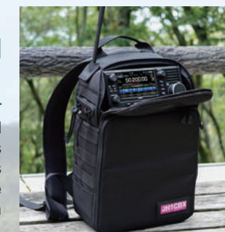
LC-192 Multi-function backpack

The IC-705 fits perfectly in the optional dedicated LC-192 multi-function backpack. It has various functions, such as holes for the antenna and holes for passing through coaxial cable and microphone cable. You can easily operate the IC-705 with it in the backpack.