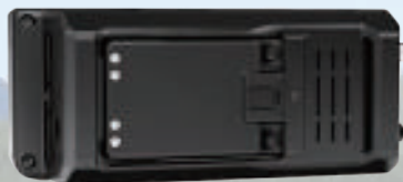
BP-272 attached (Rear panel view)

The BP-272 Li-ion battery pack comes with the IC-705. This is the same battery pack used in the ID-51 and ID-31 handheld transceivers. Of course, a 13.8 V DC external power supply can be used, too.