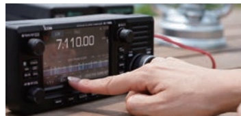
Touch screen display

The large 4.3 inch touch screen color display is the same size as the one used in the IC-7300 and IC-9700. It dramatically improves visibility and operability in the fields.