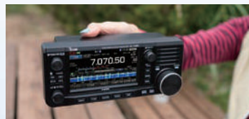
One hand holdable package

“Base station radio” performance and functions are packaged in a compact size of approximately 20 cm, 7.9 in (W) × 8 cm, 3.1in (H) × 8.5 cm, 3.3 in (D). The weight is approximately 1 kg (excluding battery pack and antenna). Its compact and lightweight design enables you to hold it with one hand.