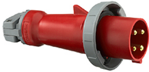
Watertight IEC Pin and Sleeve Plug, 4P5W, 60A 3PH 120/208V