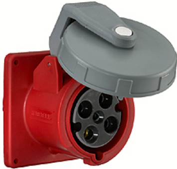
Watertight IEC Pin and Sleeve Receptacle, 4P5W, 100A 3PH 120/208V